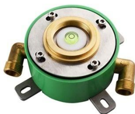
Underfloor Installation block